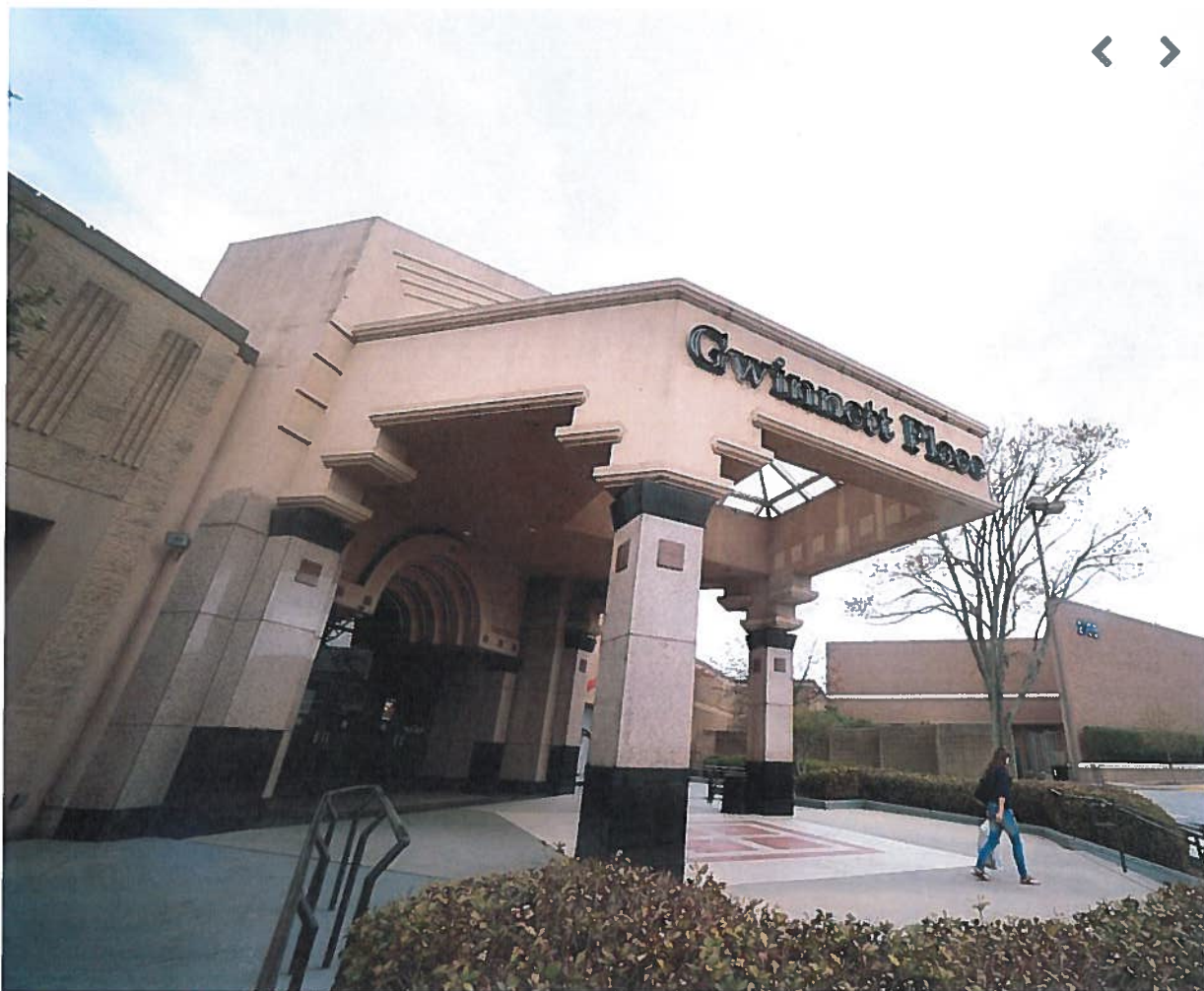
Shoppers walk out of Gwinnett Place Mall in this file photo. The mall is at the center of the Gwinnett Place Community Im, gearing up for its 2017 expansion campaign. (File Photo)

curt.yeomans@gwinnettdaily.com 9 hrs ago