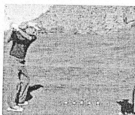
The 10 Mistakes That