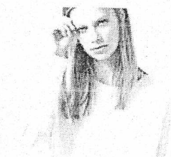
Assembling A Timeless