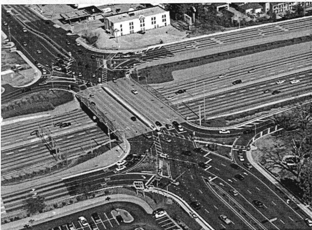
BRIDGE WORK: Work is underway on the diverging diamond interchange on the Pleasant Hill Road bridge in the Gwinnett Place CID. This scene projects what the interchange will look like when work is completed in the fall of 2013. So far, the primary work has been on the ramps, with the interchange now 10 percent complete. This scene looks west toward Gwinnett Place. The construction work will be done by ER Snell Contractor Inc. of Snellville, and will cost $4 million. For more details, got to www.gwinnettplacecid.com .