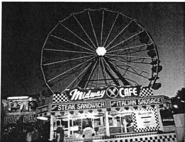
FAIR CONTINUES: Gwinnett County's Fair continues through the weekend at the Fairgrounds in Lawrenceville. Among the rides is a traditional Ferris wheel