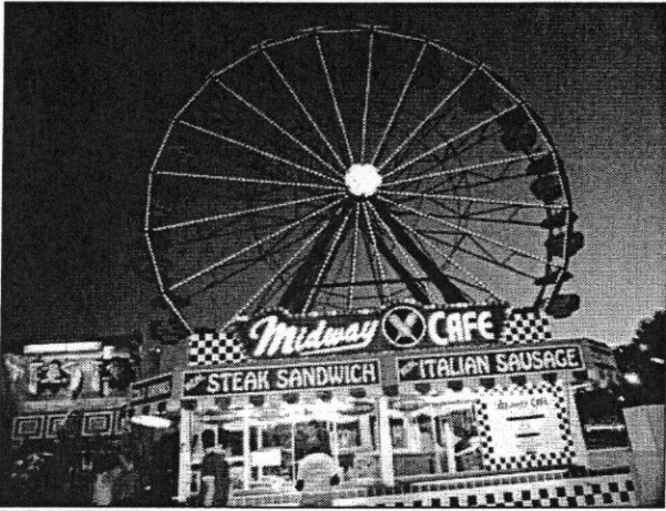
FAIR CONTINUES: Gwinnett County's Fair continues through the weekend at the Fairgrounds in Lawrenceville. Among the rides is a traditional Ferris wheel, shown in this night scene.