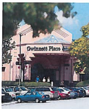
Gwinnett County commissioners approved a $780,639 contract to improve sidewalks and an intersection in the Gwinnett Place area.

The projects will be paid for with money from special sales taxes approved by voters.