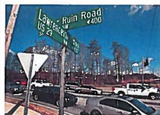
Two Gwinnett commercial districts to expand

The Gwinnett Place district has focused on transportation and mobility projects and security in the Gwinnett Place Mall area. Among other things, the Lilburn district is trying to convert Lawrenceville Highway into a boulevard-style streetscape with underground utilities, more attractive lighting and more trees.