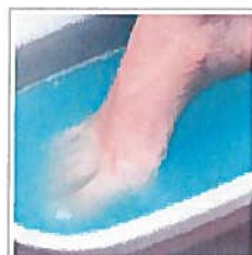
Toenail Fungus Destroyed My Life, Until I Found This