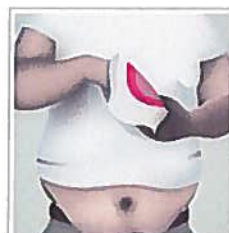
Do You Have A Fatty Liver?