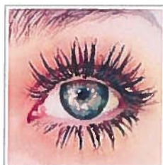
3 Out of 5 Women Want Longer Lashes. Try This