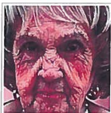
62-Yr-Old Wife Surprises Husband, Cries After Seeing Makeover