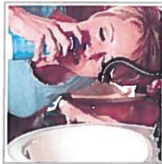
Doctor: How To Remove Puffy Dark Eye Circles In Minutes