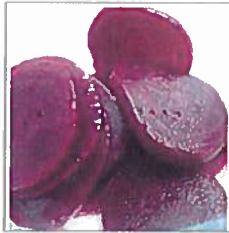
3 Foods Surgeons Are Now Calling "Death Foods"