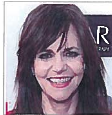
Farewell Sally Field