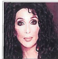
Cher Fans in Mourning