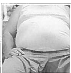
These 3 Foods Make You Look Puffy - Avoid Them