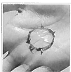
New Testosterone Booster Takes GNC by Storm