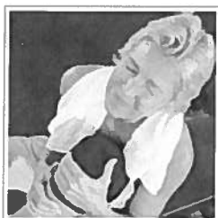
How to Relieve Joint Discomfort and Start Living Life Again