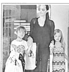
Vivienne and Knox Jolie-Pitt Are All Grown Up