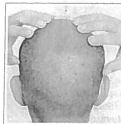
Simple Method 'Regrows' Hair. Do This