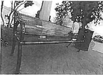
Each corner along Pleasant Hill Road between Satellite Boulevard and Venture Parkway has new benches and sidewalks as seen on Tuesday in Duluth.

"For businesses, the nicer an area is, the safer it looks and the more customers are going to want to visit," he said.