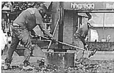
Jarett Smith, left, and Juan Morales, right, use rakes to clean up an area where sod was removed near the intersection of Pleasant Hill Road and Satellite Boulevard on Tuesday in Duluth. The area is undergoing new landscaping in order to renovate the aesthetics of the area near the mall.