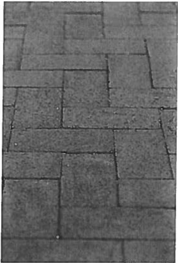
Renovated sidewalks are a new feature along Pleasant Hill Road between Satellite Boulevard and Venture Parkway on Tuesday in Duluth.