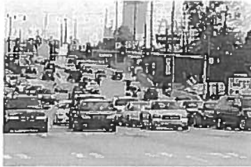
Cars pass through the intersection of Pleasant Hill Road and Gwinnett Place Drive on Tuesday in Duluth. Crews are finishing up an addition of new landscaping and signage along Pleasant Hill Road between Satellite Boulevard and Venture Parkway.