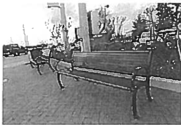
Each corner along Pleasant Hill Road between Satellite Boulevard and Venture Parkway has new benches and sidewalks as seen on Tuesday in Duluth.