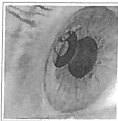
1 Method Restores Your 20/20 Vision. Try This