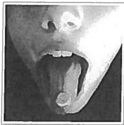
Controversial "Limitless Pill" Used By The 1%