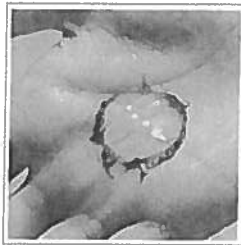
New Testosterone Booster Takes GNC by Storm