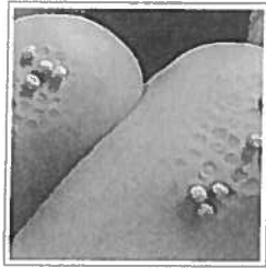
Odd Diabetes Breakthrough: Doctors Speechless