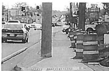
Renovated sidewalks are a new feature along Pleasant Hill Road between Satellite Boulevard and Venture Parkway on Tuesday in Duluth.