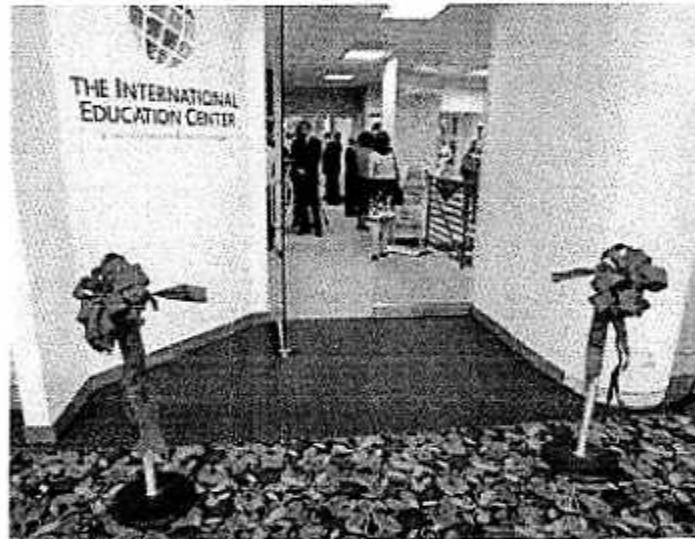
The ribbon cutting for Gwinnett Tech's new international education center drew business leaders from around the county.