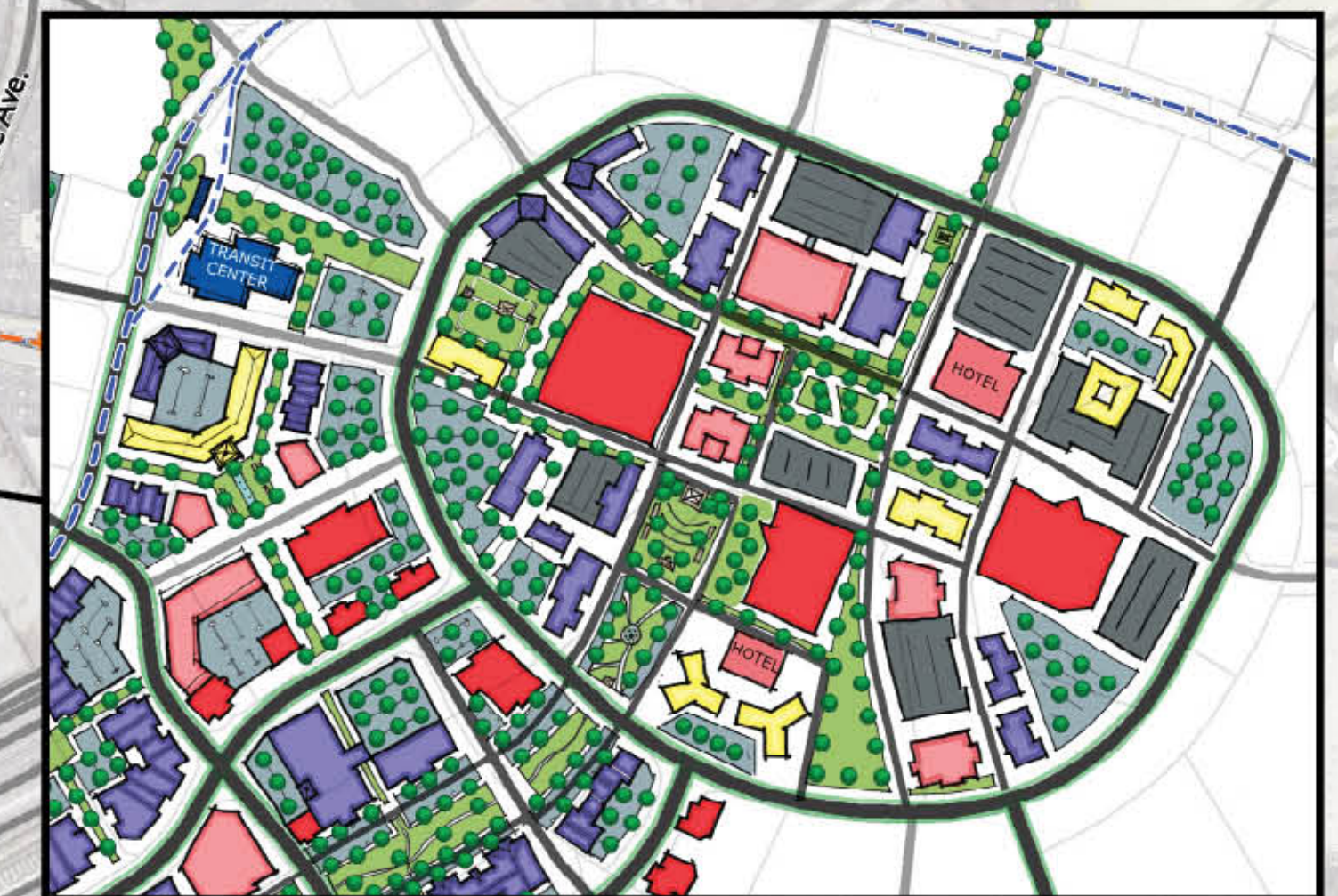
Mall Area Redevelopment - OPTION B