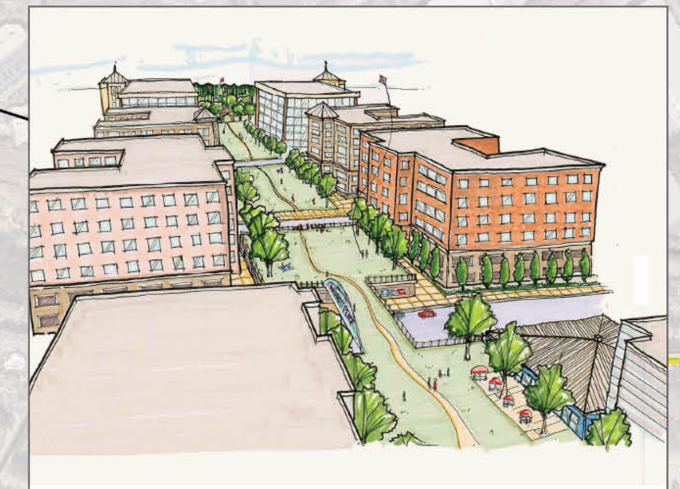
Proposed Green Pedestrian Overpass